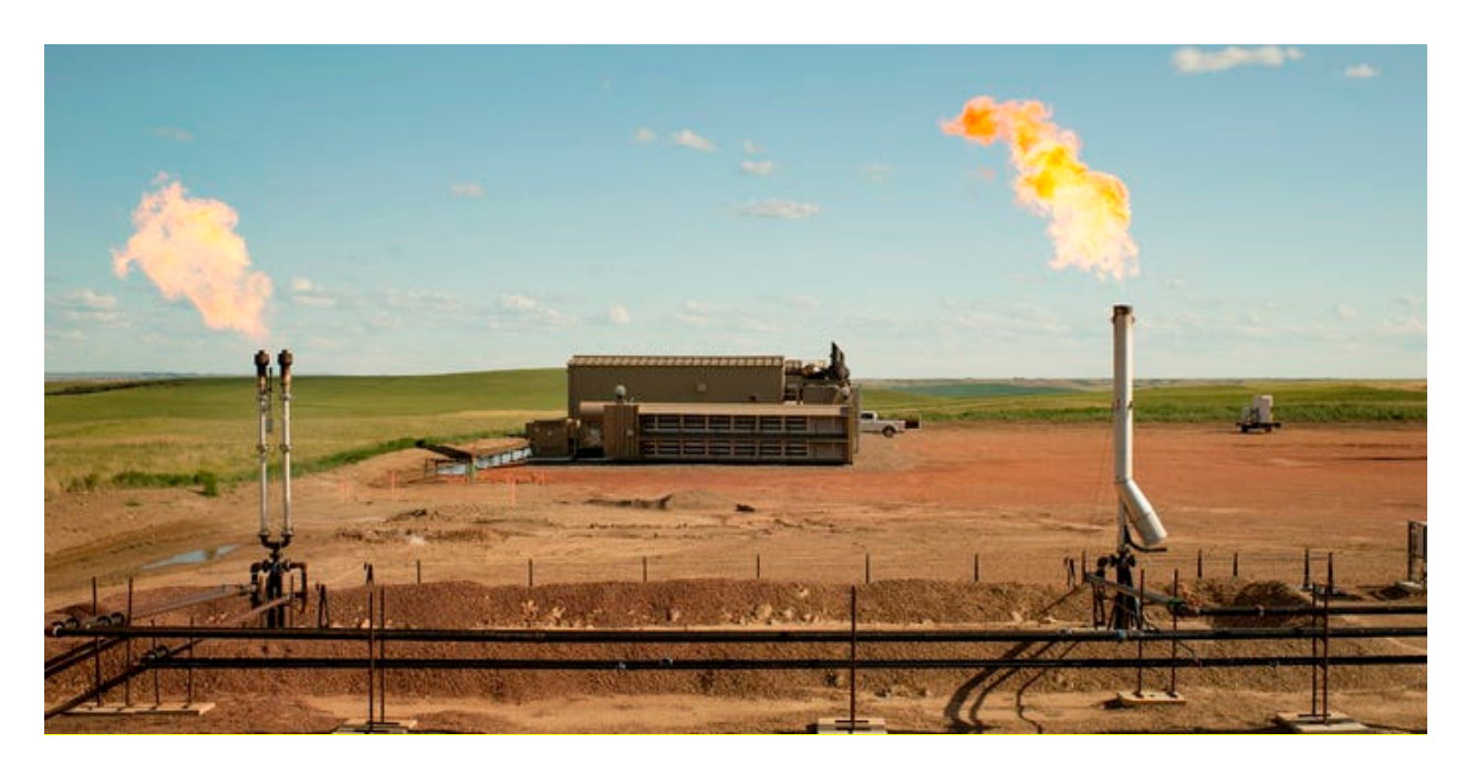
Figure 2. Crusoe Energy's Flare-mitigation Center in Montana.

There are two major approaches for using flaring for crypto mining. In the "pay for the gas" approach, the Bitcoin mining company pays for the collected gas used on the oil well site (e.g., Crusoe Energy, Inc., Denver, Colorado, USA). Under this approach the miner backs up a mobile trailer carrying pipes, generators, and computers on the drill site and uses the less profitable, stranded natural gas to power their crypto mining activities (Baker 2021). In cold areas, the supercomputers produce up to 160 degrees Fahrenheit of heat to keep the workers warm.